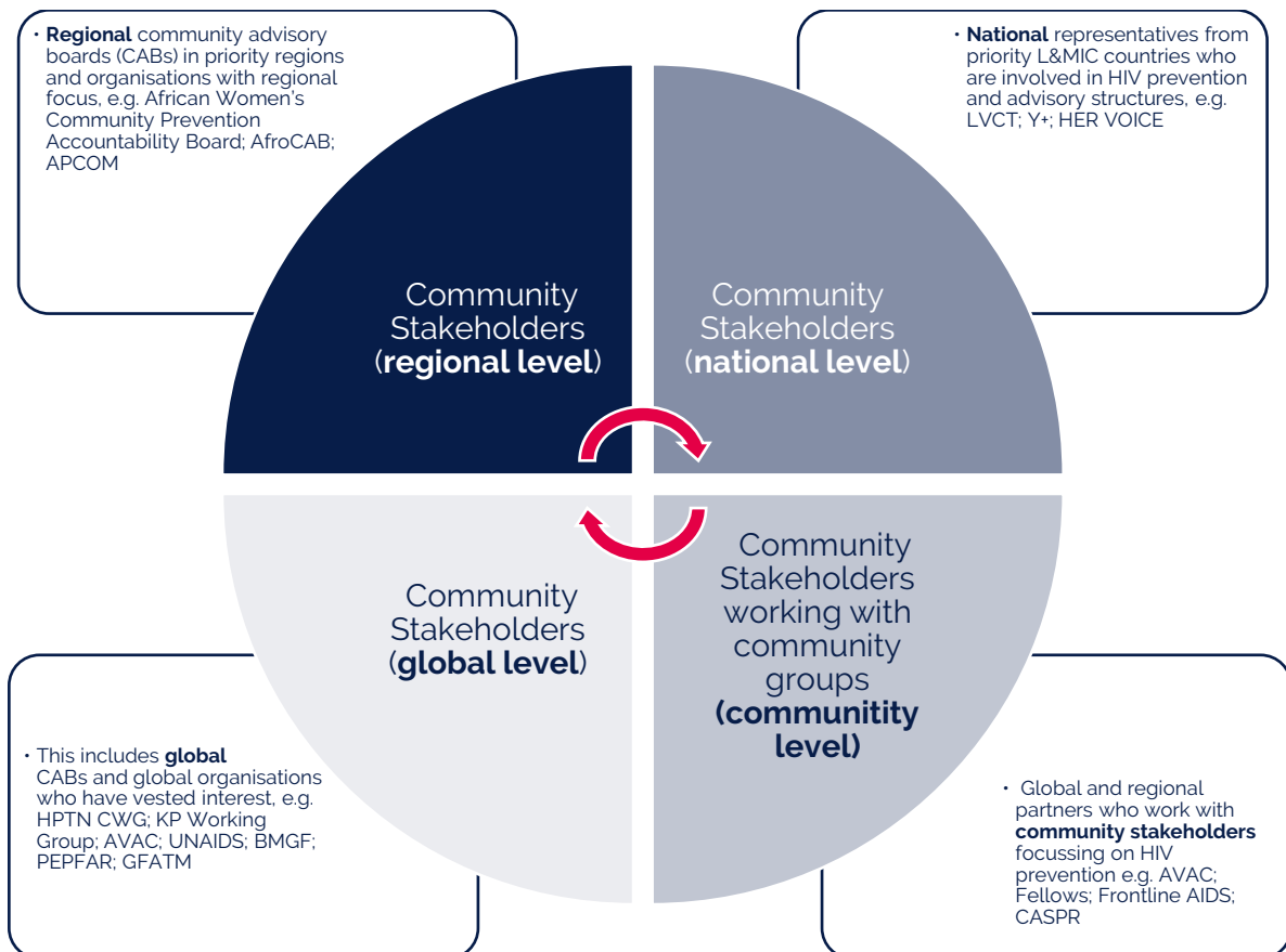
Figure 3: Circle of ViiV Community Stakeholders

Figure 3 outlines the diversity of ViiV Stakeholders supporting our common goal for access. Our focus will centre on existing regional community stakeholder groups, structures and partners that can cascade to the country and community levels. We will also work closely with global stakeholders to align and amplify messages and collaborate with structures in their networks where possible.