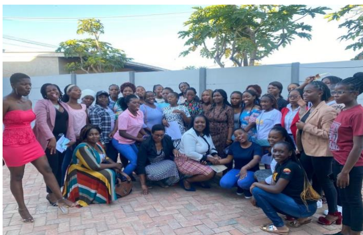
PZAT training of HIV prevention champions