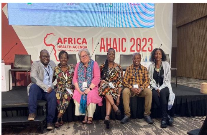
Africa Health Agenda International Conference