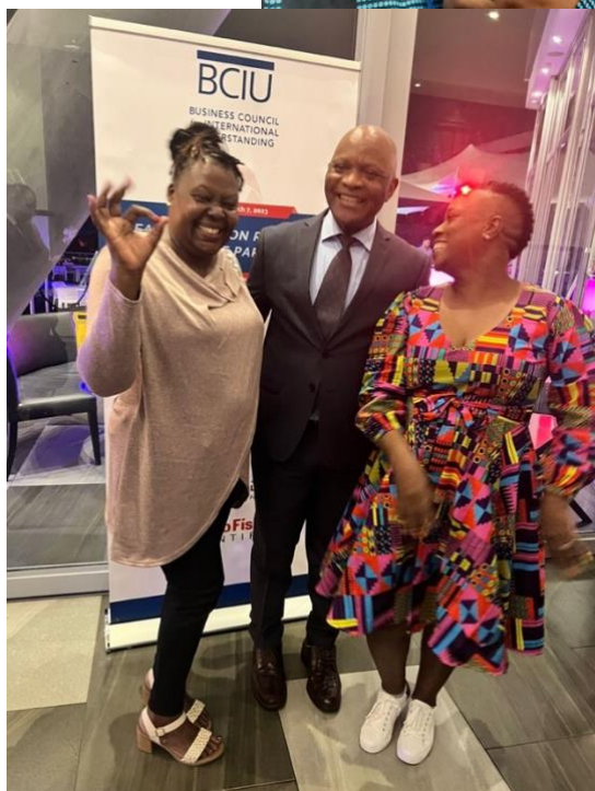
PEPFAAR COP 23