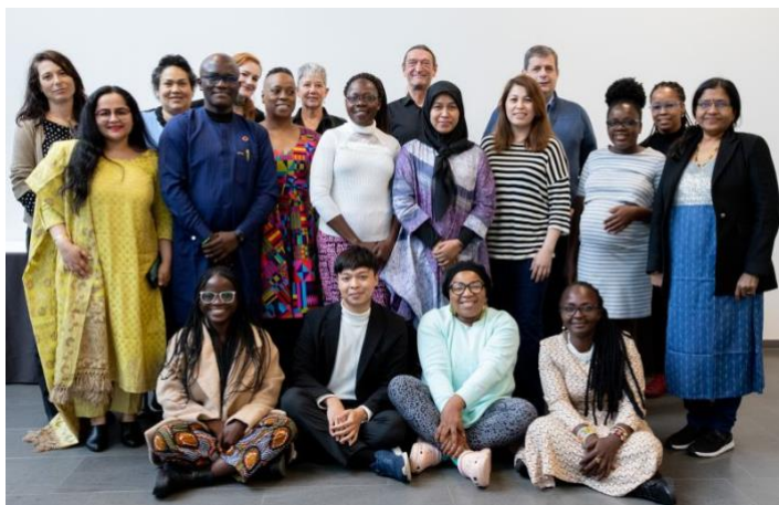
MPP Community Advisory Board