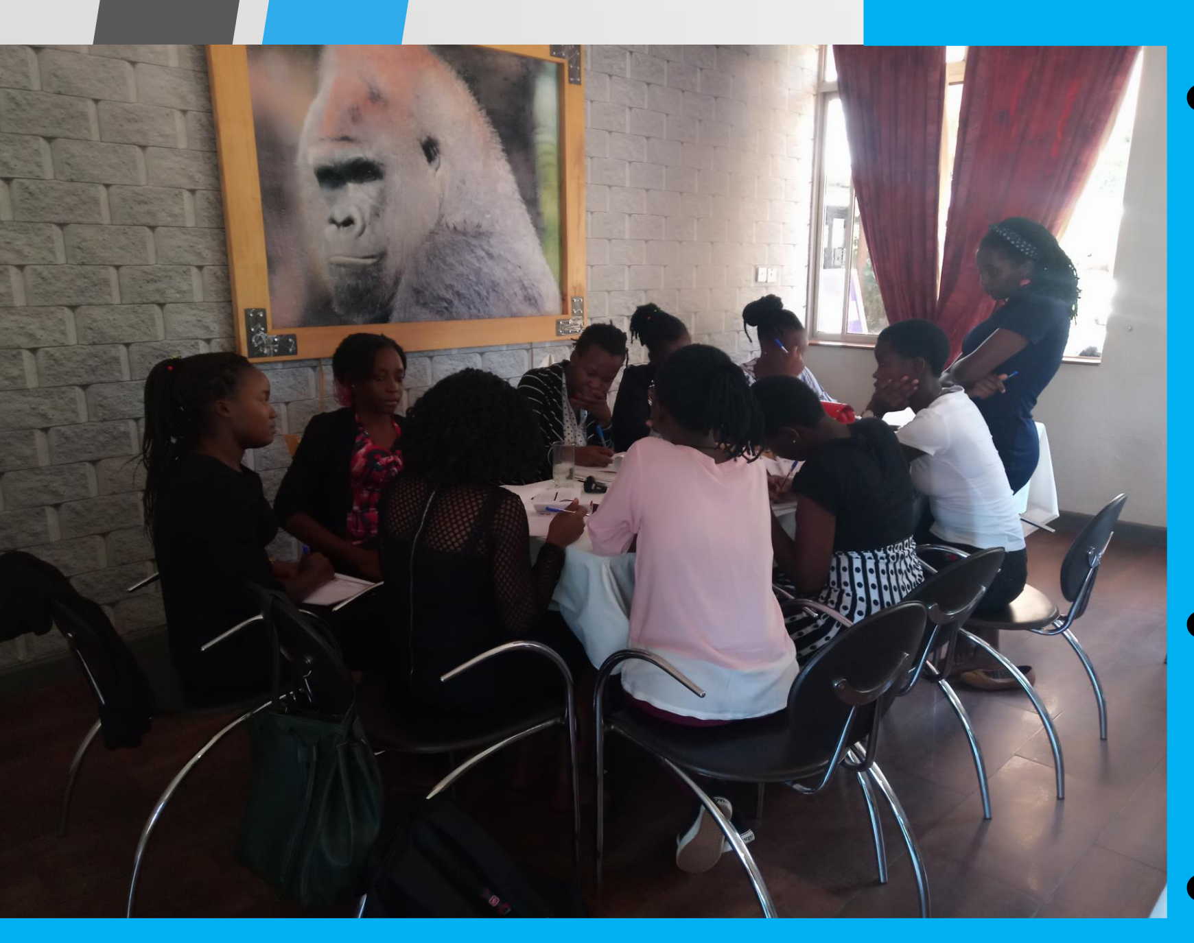
My take home

celebrating the quick wins Advocacy never ends with you...allies are everything