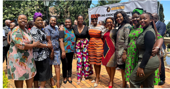
The African Women's HIV Prevention Community Accountability Board (AWCAB) with UNAIDS Executive Director Winnie Byanyima