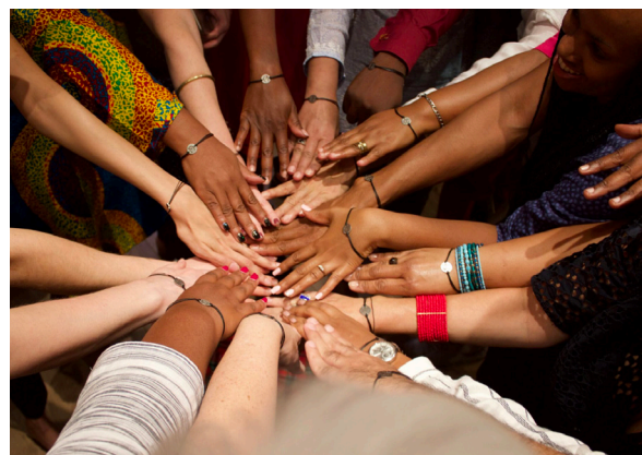
AVAC partners gather in New York, October 2023

Founded in 1995 to spur the development of preventive HIV vaccines, today AVAC is a leading and widely respected voice in the global response to HIV/AIDS. AVAC has established trusted, influential, and durable relationships with a wide spectrum of stakeholders—from policy makers to civil society advocates, industry to academics, product developers to program implementers, and beyond. AVAC has expanded its portfolio to include a wide range of HIV prevention options as well as related research areas, including SRHR, TB and COVID-19. AVAC’s approach continues to underscore the need for a comprehensive, integrated and sustained agenda to refine the pathway from product development to end user and, ultimately, to help end the epidemic.