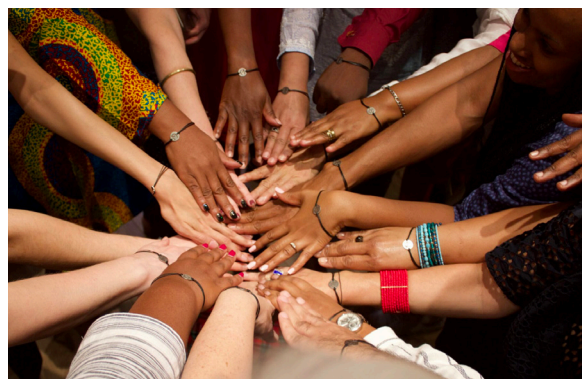
AVAC partners gather in New York, October 2023

Founded in 1995 to spur the development of preventive HIV vaccines, today AVAC is a widely respected voice in the global response to HIV/AIDS and the push for global health equity. AVAC has longstanding, trusted and durable relationships with a wide spectrum of partners—from civil society advocates to policy makers, industry to academics, product developers to program implementers, and beyond. Throughout its history, AVAC has worked to expand and strengthen the reach and influence of civil society advocates and organizations to monitor, support and help shape the HIV prevention response from research to rollout.