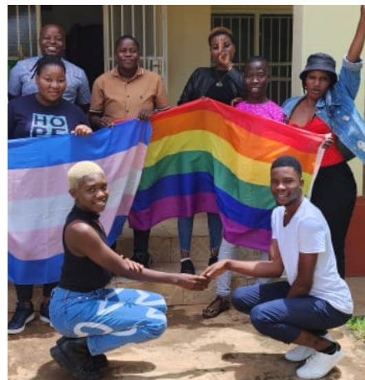
Representatives from AVAC Partner organization LITE (Lesbians, Intersex, Transgender and Other Extensions)

AVAC has longstanding trusted relationships with a wide spectrum of stakeholders—from policymakers to civil society advocates, industry to academics, product developers to program implementers, and beyond. AVAC is viewed as a credible source of information, sharing vital science and research to distill and translate it for affected communities. At the same time, AVAC plays an important role in connecting KP individuals and KP-led organizations to scientists, industry leaders, policy makers and the media to ensure that responses are community-led and that innovative, user-centered prevention options are developed and delivered ethically, expeditiously and equitably.