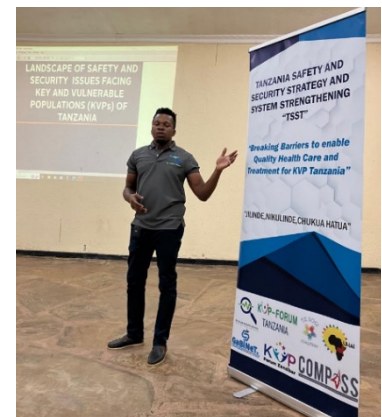
An AVAC partner speaks at an operational skills-building training for KP-led organizations